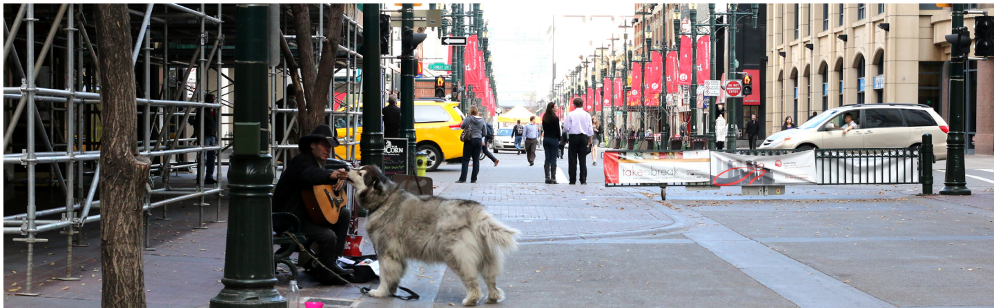
This man shares a treat with his dog on a pleasant Monday afternoon. Buskers on Stephen Avenue are a common site during warmer weather, and often bring their pets to add more life to the streets.