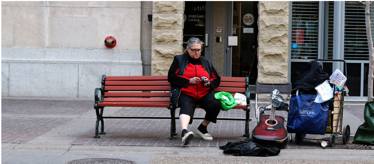
Buskers such as this woman, pictured above, liven Stephen Avenue with their sound.

Stephen Avenue is home to some of Calgary's best restaurants and in the summer, patios. Whether you're in the mood for steak or sandwiches and coffee, Stephen Avenue has something for everyone.